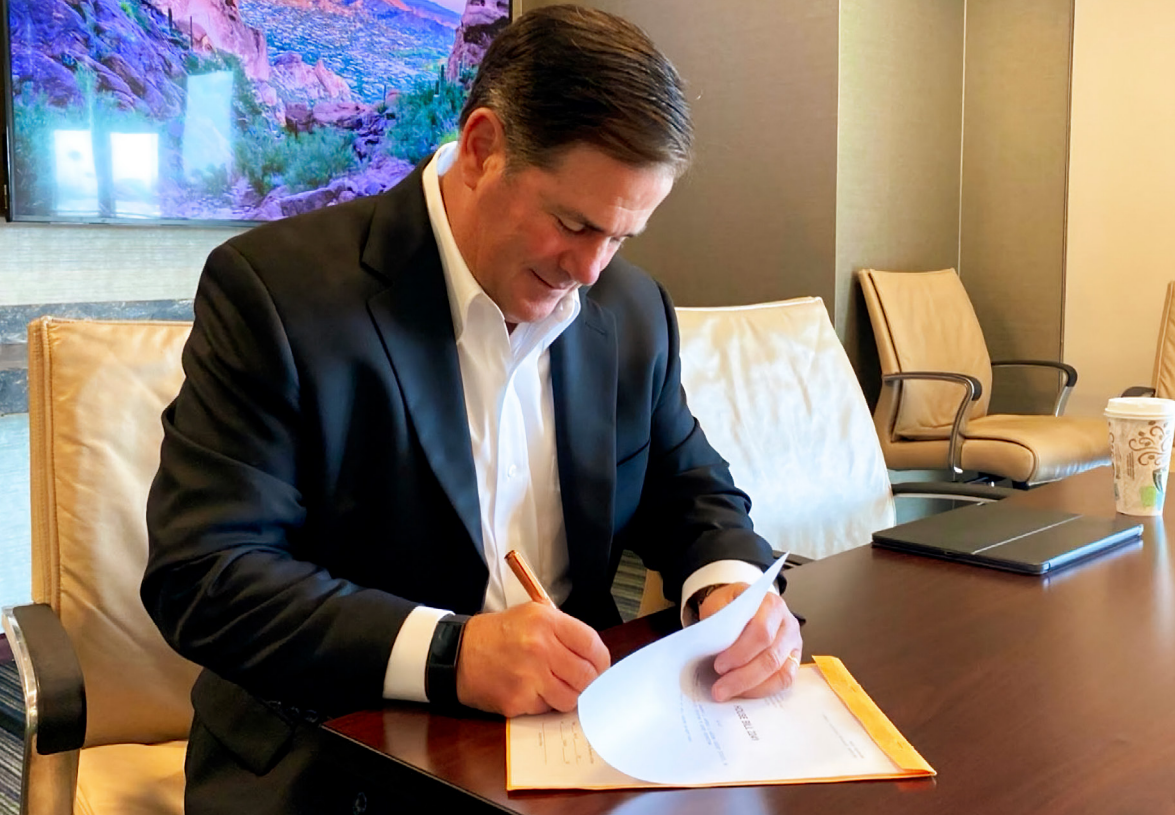
Governor Doug Ducey signing Arizona's Holocaust Education Bill HB 2241, July 9, 2021.